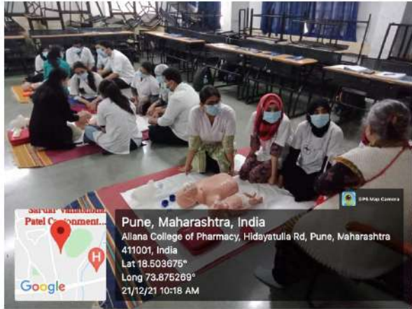
Pune, Maharashtra, India Allana College of Pharmacy, Hidayatulla Rd, Pune, Maharashtra 411001, India Lat 18.503675° Long 73.875289° 21/12/21 10:18 AM