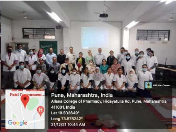
Pune, Maharashtra, India Allana College of Pharmacy, Hidayatulla Rd, Pune, Maharashtra 411001, India Lat 18.503649° Long 73.875242° 21/12/21 10:44 AM