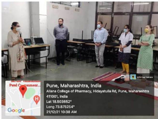
Pune, Maharashtra, India Allana College of Pharmacy, Hidayatulla Rd, Pune, Maharashtra 411001, India Lat 18.503652° Long 73.875254° 21/12/21 10:38 AM