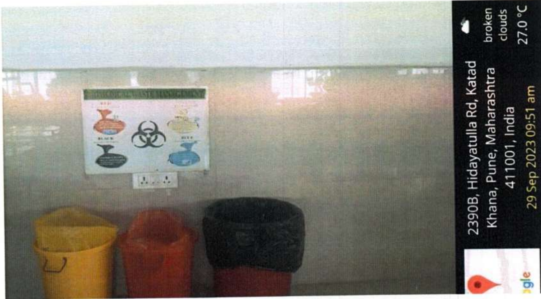
Biomedical Waste Segregation