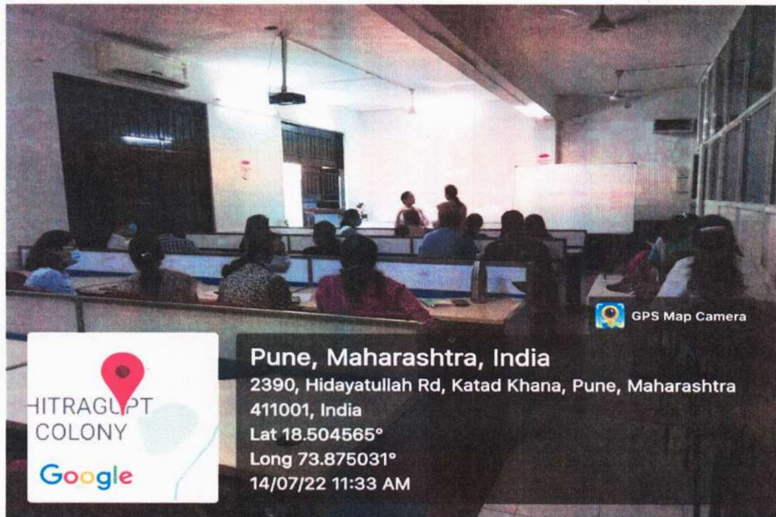
FACULTIES ATTENDING THE LECTURE