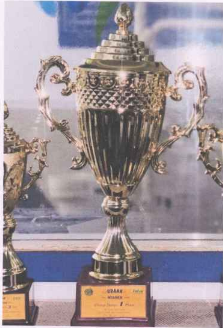
TROPHY GROUP DANCE 1 ST PLACE UDAAN 2022