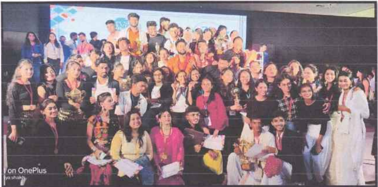
Award-winning performances by Team MARDC at the IDA Pune Dental Show – Udaan 2022 Shiv Chhatrapati Shivaji Sports Complex, Balewadi, Pune.

PRINCIPAL M. A. RANGOONWALA COLLEGE OF DENTAL SCIENCES & RESEARCH CENTRE, PUNE