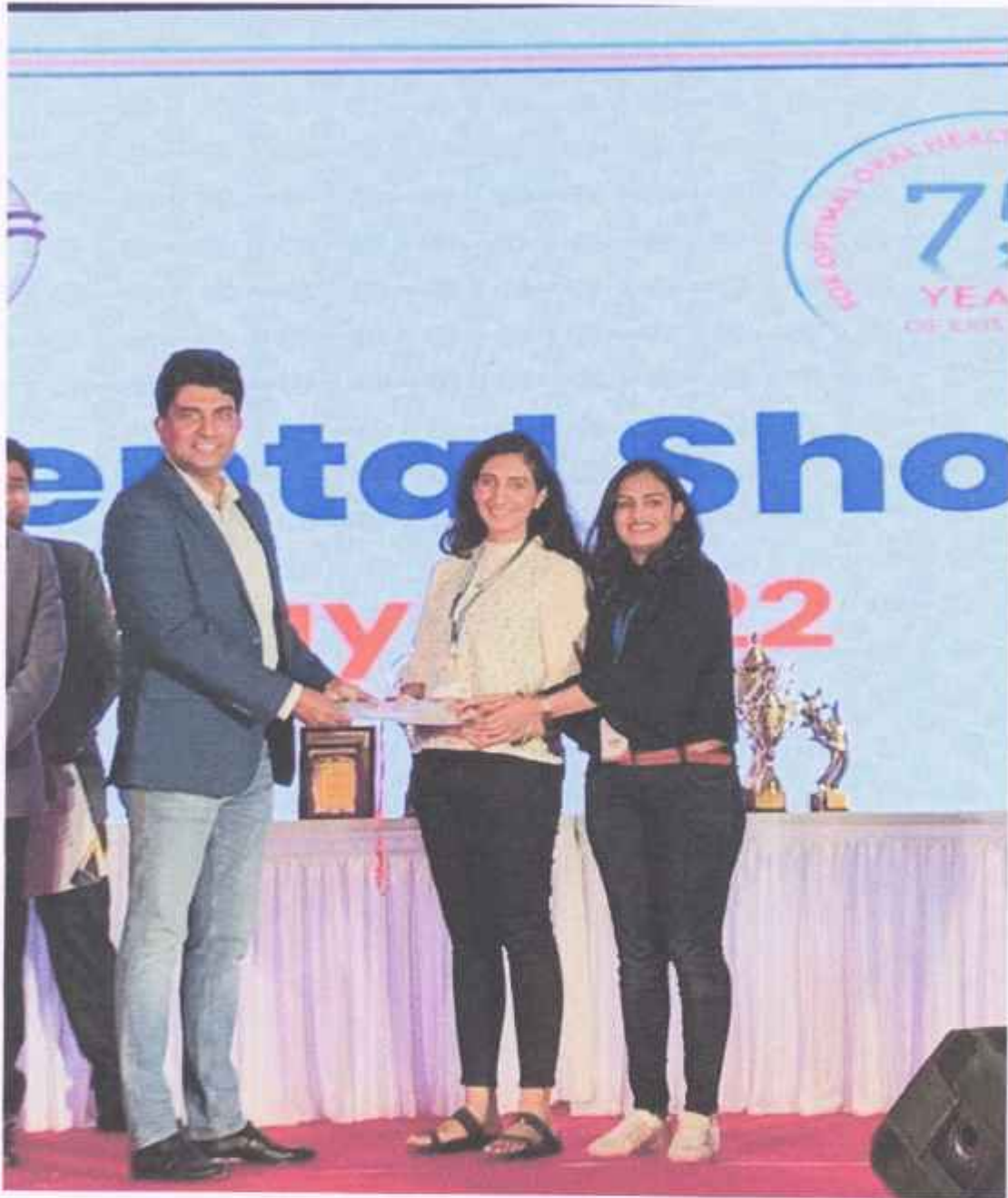
UDAAN, PUNE DENTAL SHOW 28 TH MAY 2022