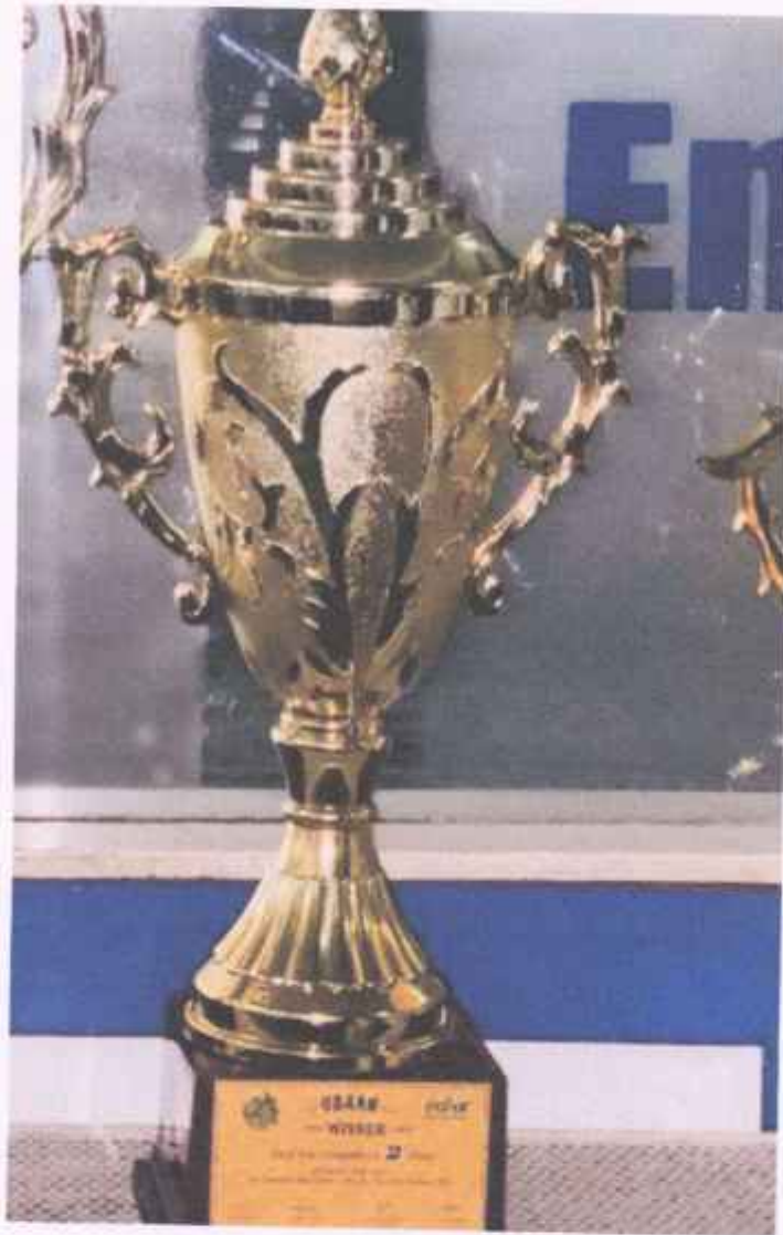
TROPHY DEBATE COMPETITION 2 nd PLACE UDAAN 2022

PRINCIPAL M. A. RANGOONWALA COLLEGE OF DENTAL SCIENCES & RESEARCH CENTRE, PUNE