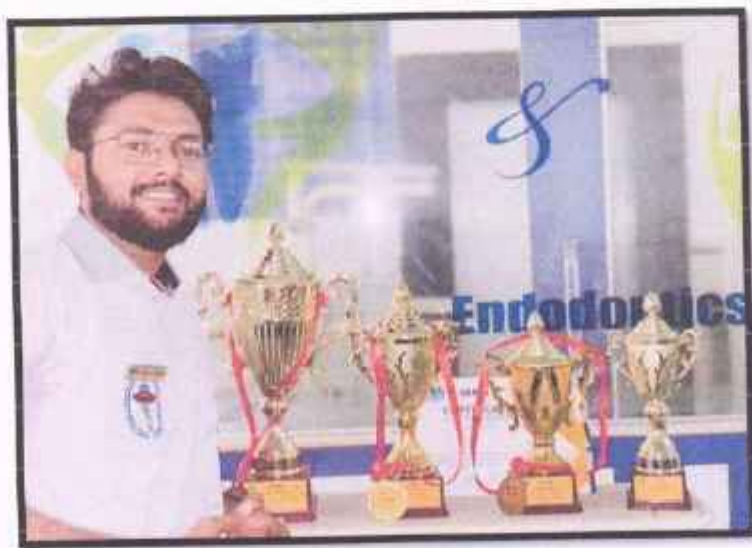
IDA Pune Dental Show – Udaan 2022 Awards