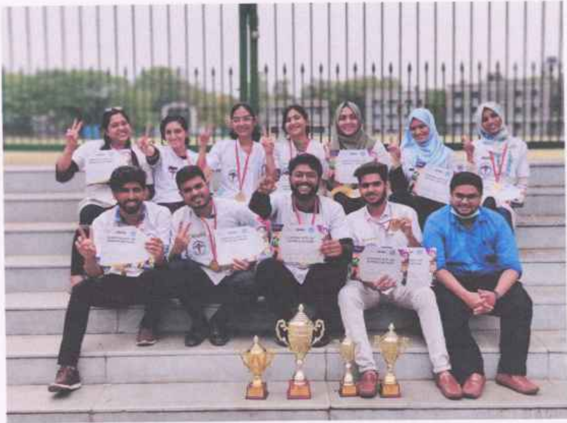
WINNERS WITH AWARDS AND CERTIFICATES