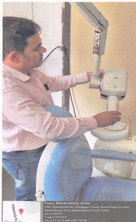
X-ray machine repair