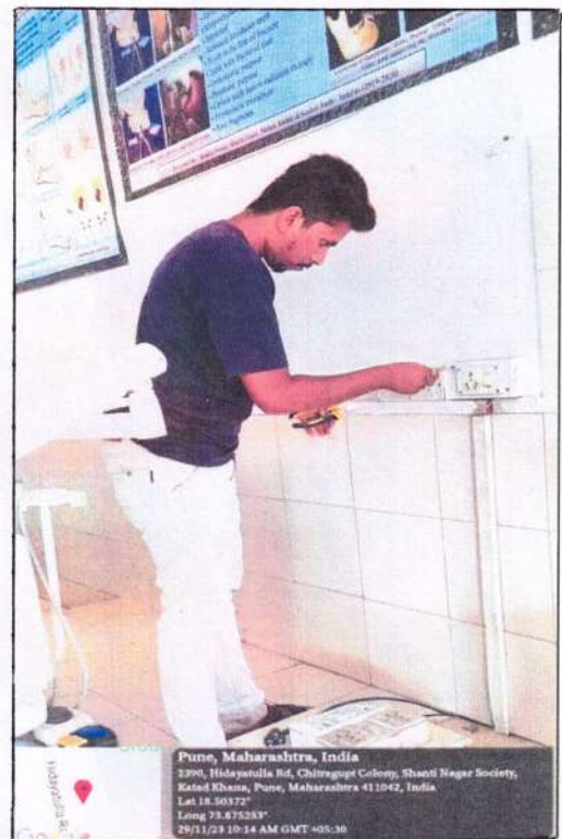
Electrical equipment repair

PRINCIPAL M. A. RANGOONWALA COLLEGE OF DENTAL SCIENCES & RESEARCH CENTRE, PUNE