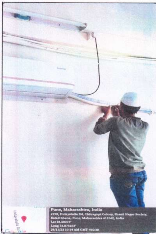
Air conditioner repair