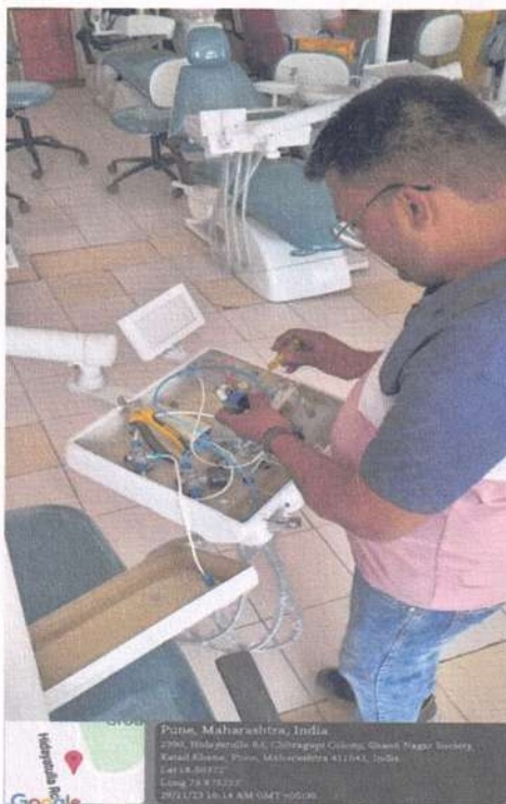
Dental equipment repair