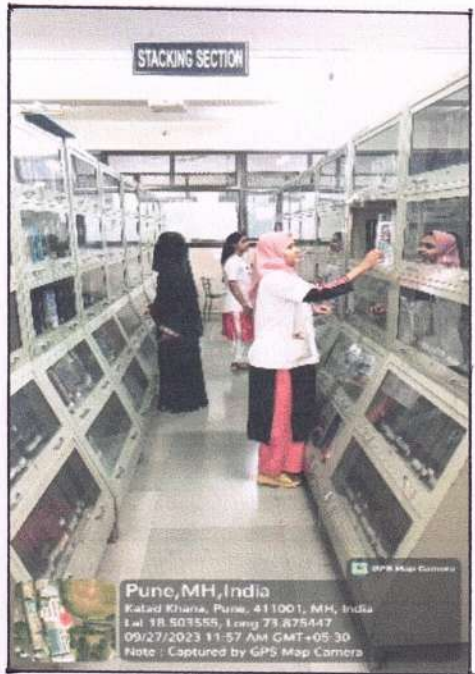
Books stacking section