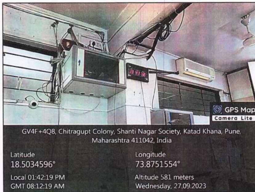
Wi -fi facility