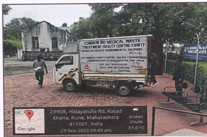
Bio-medical waste collection