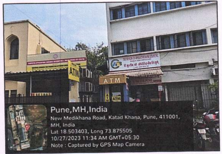
Muslim-Co-operative Bank and ATM (Azam Campus)