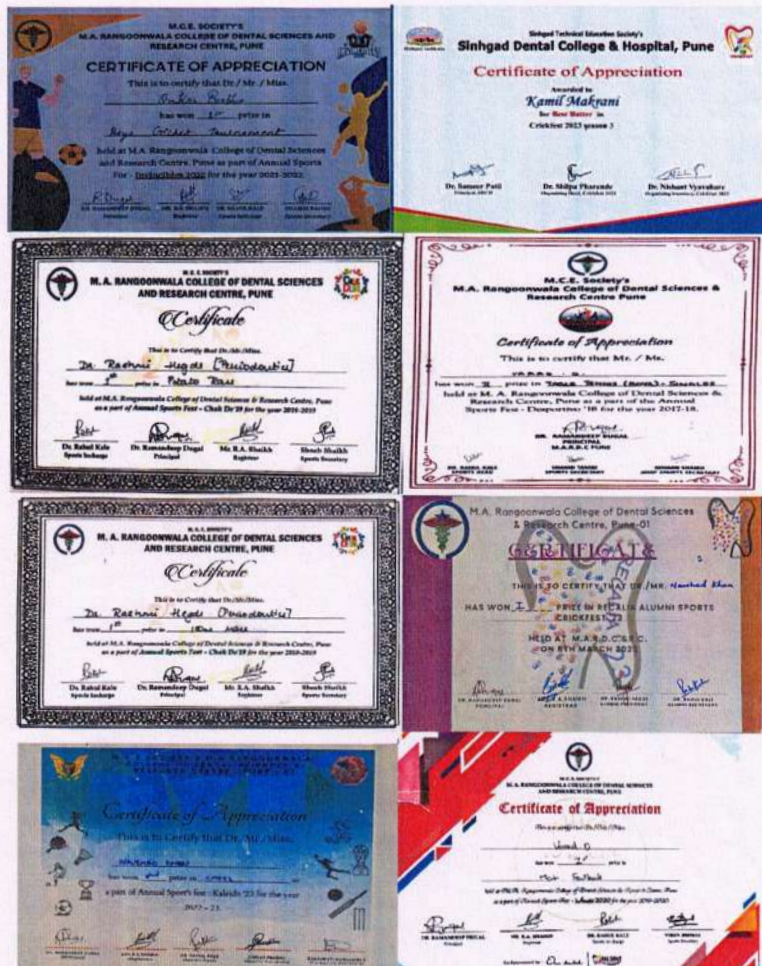
Certificates Awarded To Participants In Various Sports Events [ Year 2019- Year 2023 ]