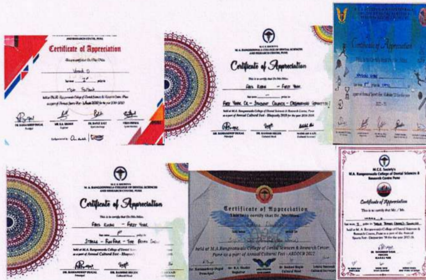
Certificates Awarded To Participants In Various Cultural Events [ Year 2019 – Year 2023 ]

PRINCIPAL M. A. RANGOONWALA COLLEGE OF DENTAL SCIENCES & RESEARCH CENTRE, PUNE